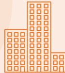
LOW-RISE, MID-RISE & HIGH-RISE APARTMENTS